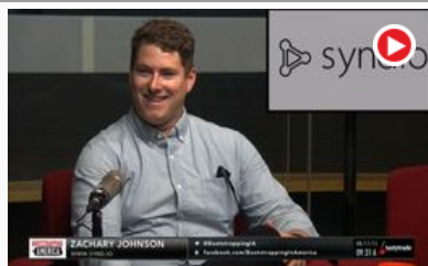
August 17, 2015