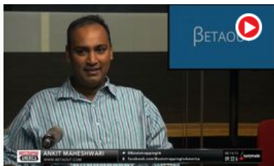
August 14, 2015