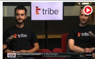
August 14, 2015