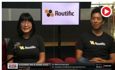
August 13, 2015