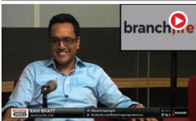
August 18, 2015