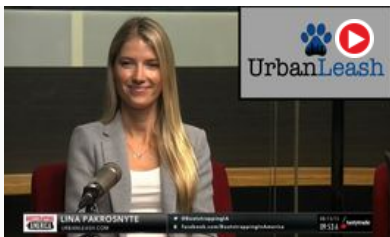
August 13, 2015